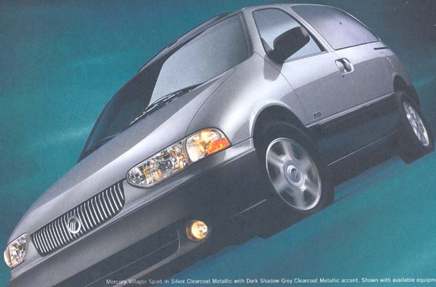
Mercury Villager Sport in Silver Clearcoat Metallic with Dark Shadow Grey Clearcoat Metallic accent. Shown with available equipment.