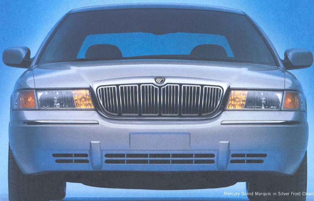
Mercury Grand Marquis in Silver Frost Clearcoat Metallic.