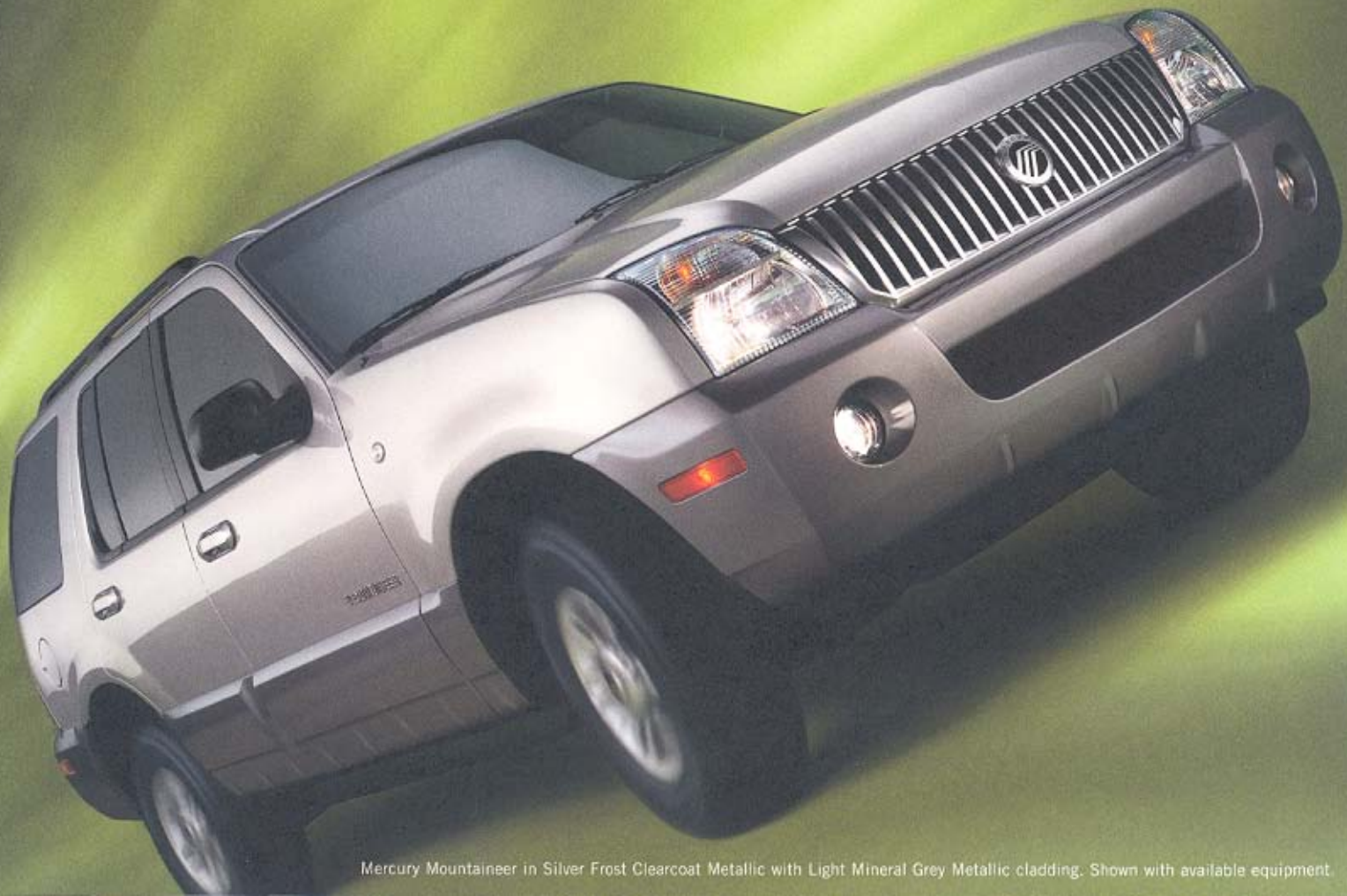
Mercury Mountaineer in Silver Frost Clearcoat Metallic with Light Mineral Grey Metallic cladding. Shown with available equipment.