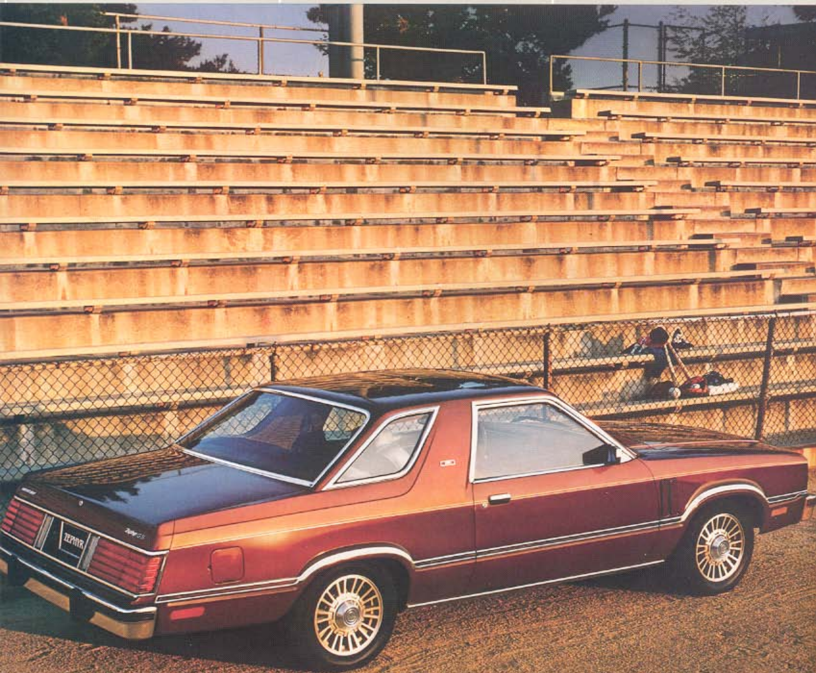
Zephyr Z-7 GS in Medium Vaquero Metallic over Dark Cordovan Metallic, with optional Flip-Up/Open Air Roof.

Inside, there's generous space in this sporty, personal-size car. And a number of thoughtful touches, such as tinted rear window glass and deluxe seat belts with