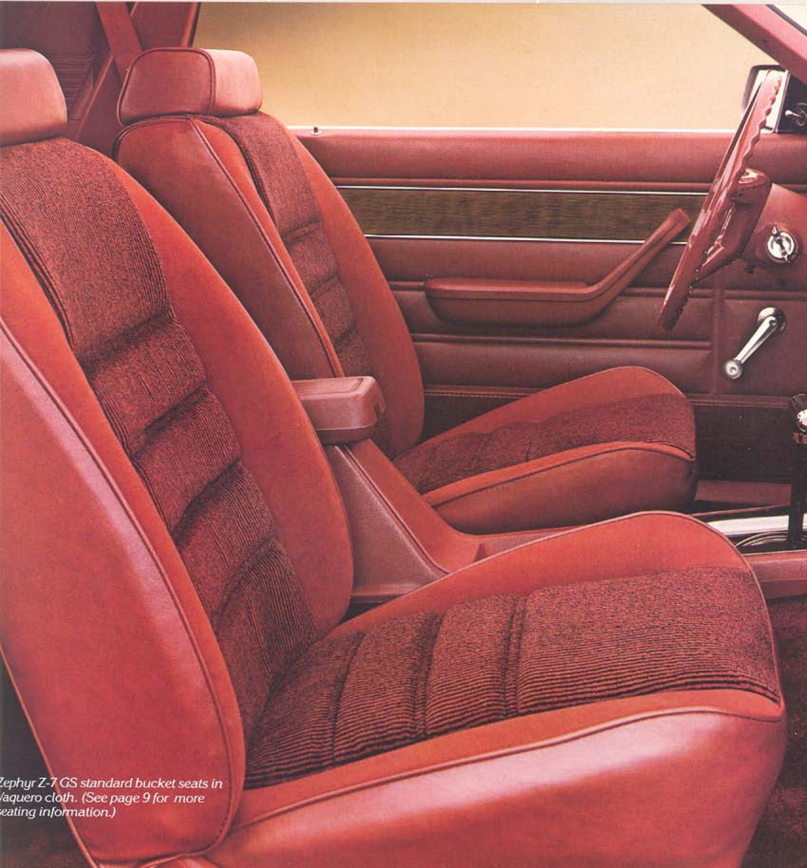
Zephyr Z-7 GS standard bucket seats in vaquero cloth. (See page 9 for more seating information.)

The Zephyr Z-7. Puts a little more Z-est in your life.