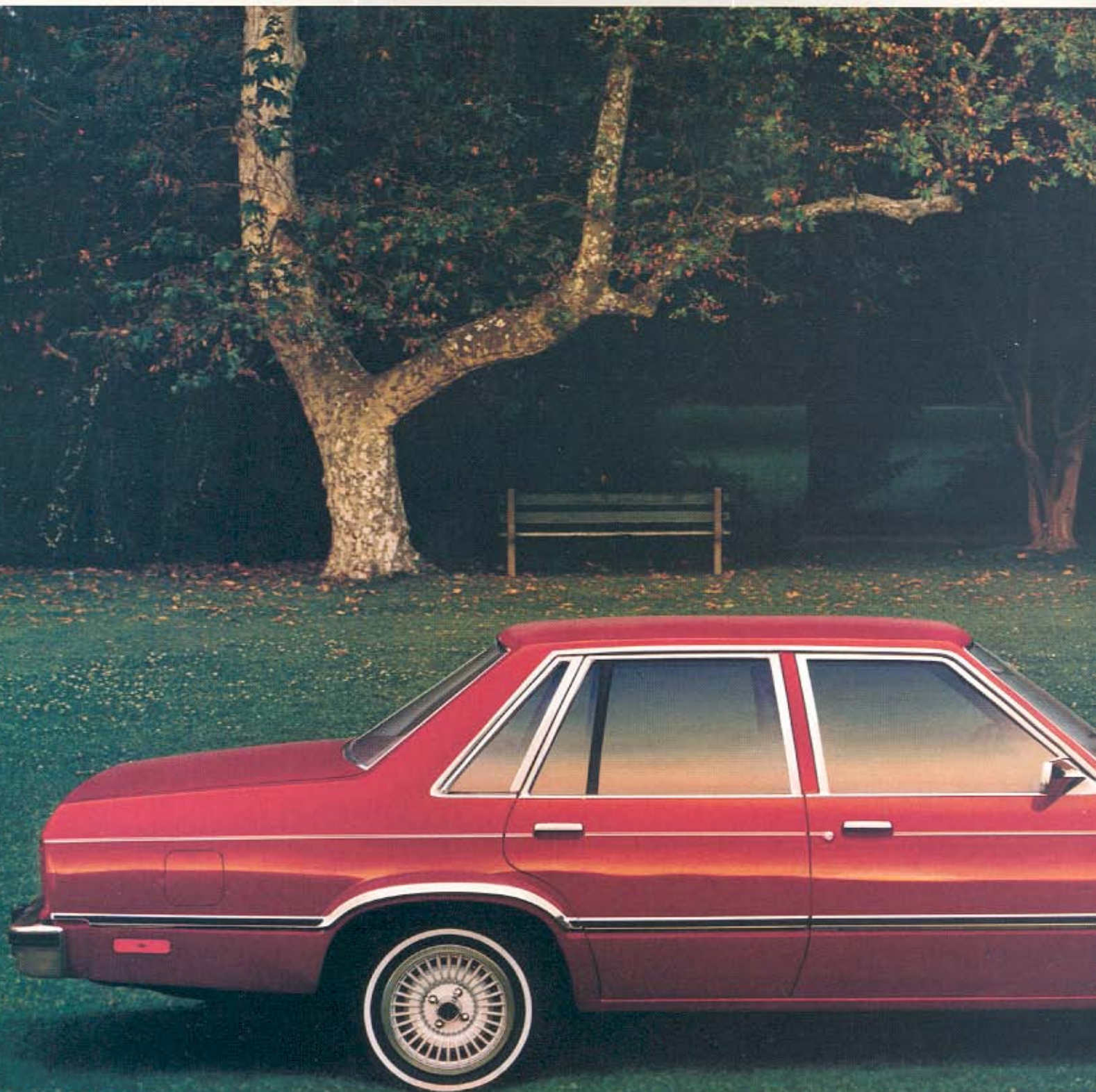
In the foreground: '82 Zephyr GS four- door in Medium Red. Background: Zephyr Z-7 in Fawn.

And driveability? Zephyr gives you a just-right balance between power and weight. Standard is the smooth-running 2.3 liter, two barrel, four-cylinder engine. Or for more power, step up to Zephyr's