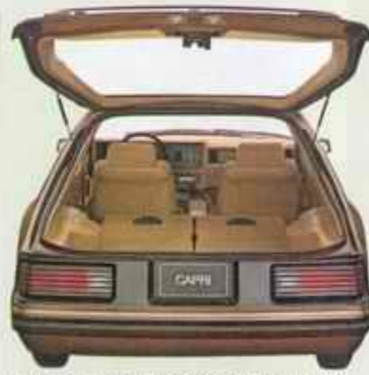
cylinder with Electronic Fuel Injection, or the 5.0 liter High Output V-8 with Electronic Fuel Injection.

For those who prefer a larger displacement engine, the GS is available with a 3.8 liter six-