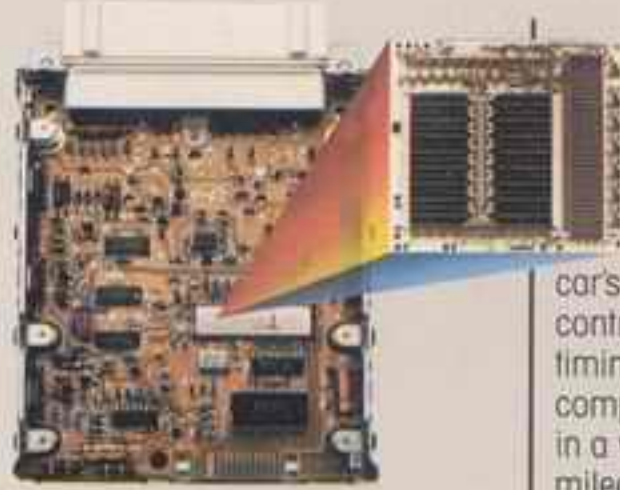
speed manual overdrive transmission. Its brain is the Electronic Engine Control (EEC-IV), shown

Capri Turbo RS runs on some of the most sophisticated automotive hardware available today. Its heart is a 2.3 liter engine, turbocharged, electronically fuel-injected and teamed with a five-